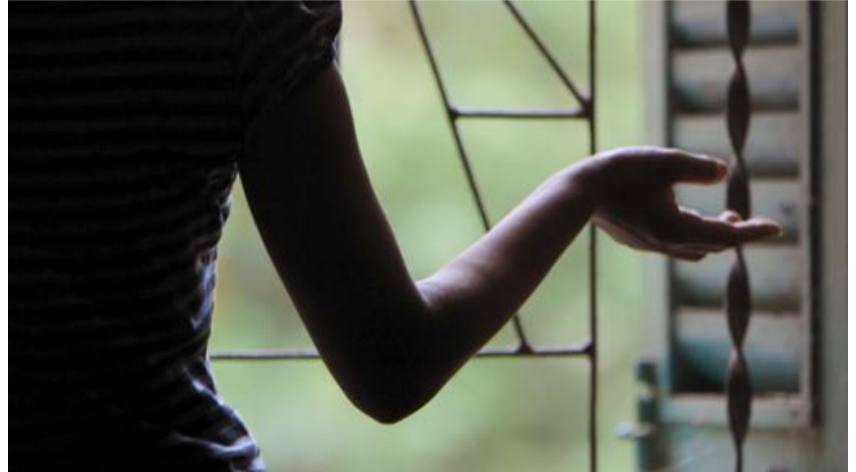
An anonymous trafficking survivor talks about how dance helped her heal after she was sold into a brothel in Kolkata, India.