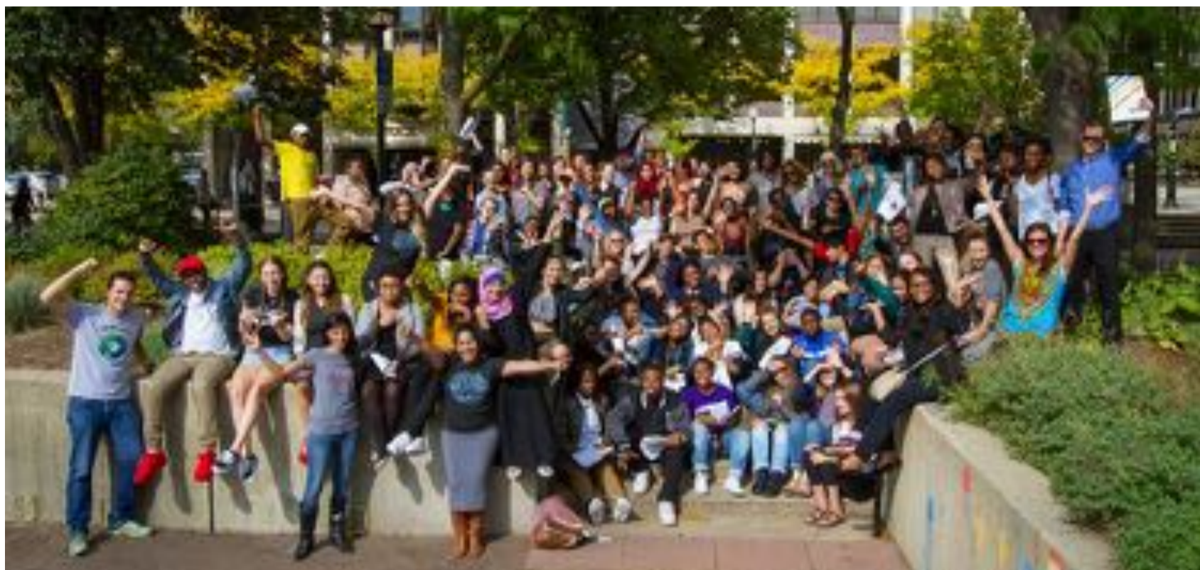
The filmmakers, University of Michigan staff and Driftseed team at the U-M Symposium, October 2016.